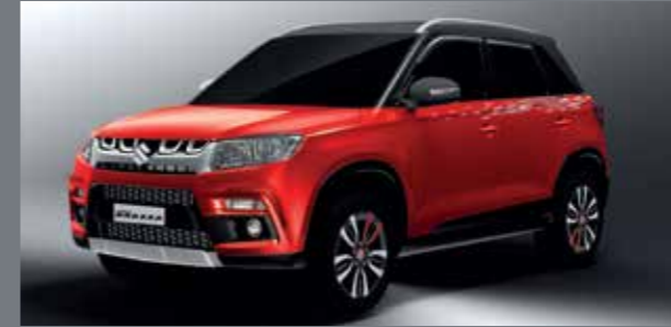
Play the glamorous way.

For the first time ever in the segment, you can enjoy personalization to the max with the Vitara Brezza. It matches your personality and you can enjoy a custom car experience straight from the showroom. So, go on and choose your sport.