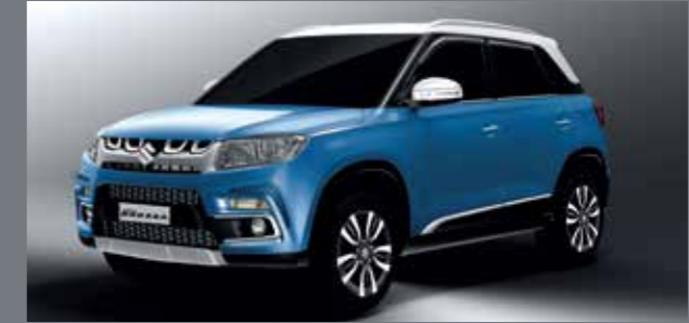
Play the urban way.