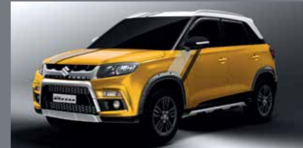
Play the sporty way.